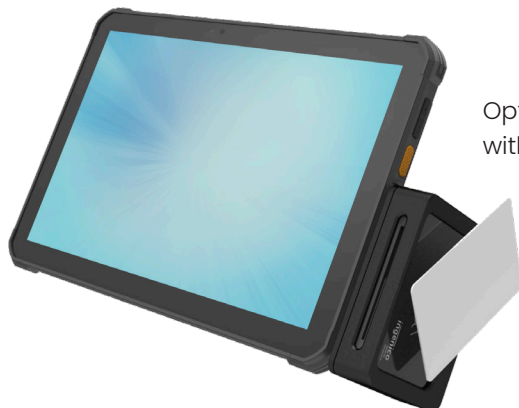
Optional Rotating Hand Strap with Payment Device Holder