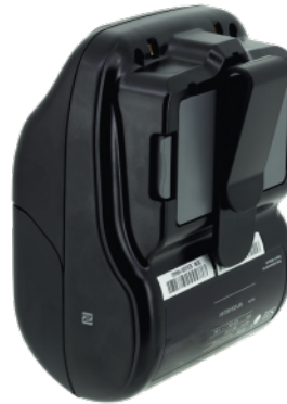
MP-B30L Belt Clip