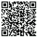
K120 3D demo