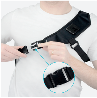
Clip buckle closure