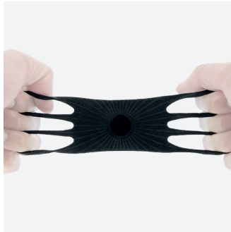
Silicone holder for terminal from 5 to 7"