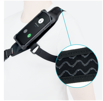
Anti-slip band on the shoulder for optimal support