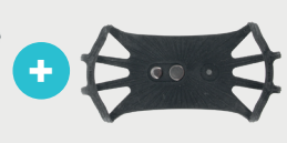
1 Universal holder for 5-7" device with riveted ClipFast