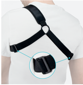
2 adjusters allow you to then adjust the shoulder strap to your morphology