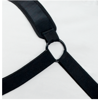
Ergonomic ring for optimal comfort