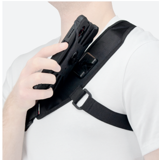
ClipFast system for quick and secure installation