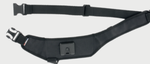
1 Chest Strap with ClipFast interface