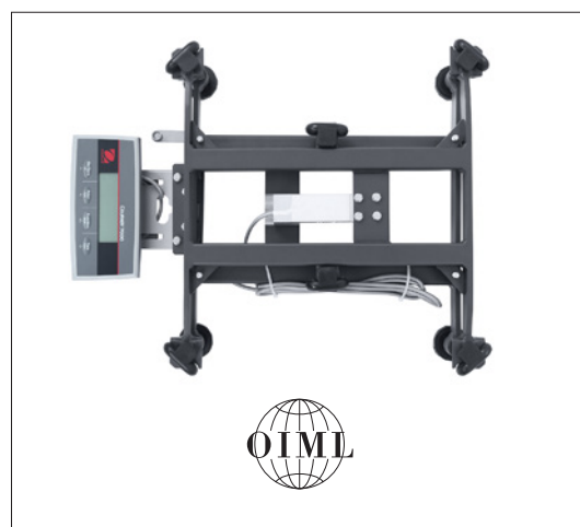
Sturdy powder-coated steel frame holds up to heavy daily shipping use