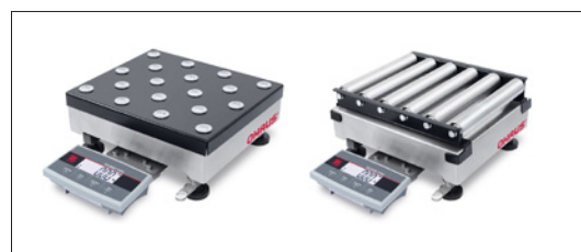
Ball Top and Roller Top Platform Options

Provides simple averaging of weights for unstable loads.