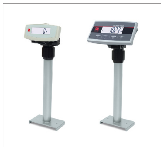
Optional Remote Display on column mount and Column Mount for scale indicator available