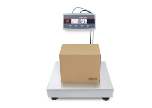
Integrates with shipping system software

The large, bright display clearly shows weights in dimly-lit warehouse and loading dock areas. The indicator comes base mounted but can be attached to a column for display above the platform. A second Remote Display and column can be used to show the results for added verification.