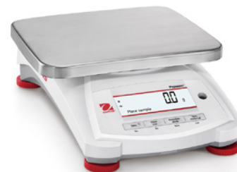
PX12001 and PX12001/E model