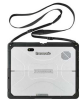
(tablet sold separately)