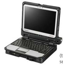
(tablet sold separately)

(VDA fits in any Gamber-Johnson/Havis 31 Vehicle Dock)