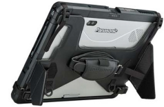
(tablet sold separately)

(Not compatible with any tablet dock that has a tablet with a quick-release SSD or with Gamber-Johnson Tablet Vehicle Dock when tablet is equipped with long life batteries)