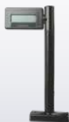
90ACC0340 Single Display/Single Interval