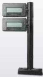
90ACC0343 Dual Display/Single Interval