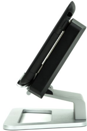
Fully-adjustable viewing angle