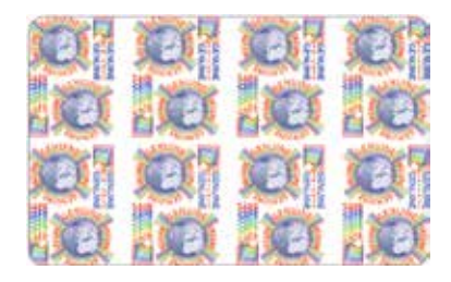
Evolis Genuine Globes Design