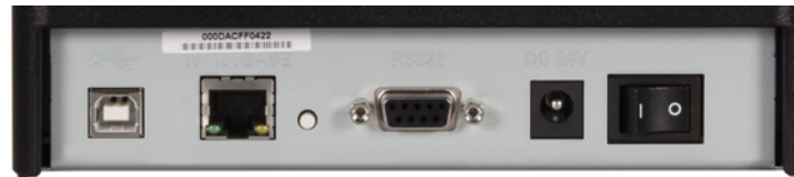
Ethernet LAN, USB & Serial interfaces as standard