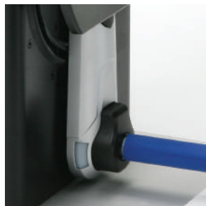
Colored LED indicator provides rewriter operation status