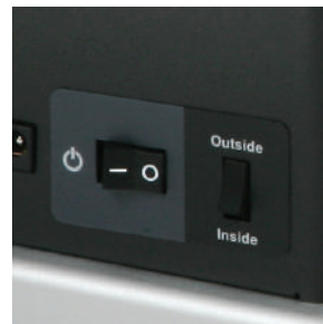
Rewinding direction switch to rewind "inside or outside" label rolls