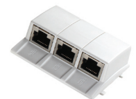
ETHERNET MODULE KT-6511-0000D-WR

For more information on how the AP 6511 can benefit your business, please visit us on the web at www.motorola.com/ap6511 or access our global contact directory at www.motorola.com/enterprisemobility/contactus