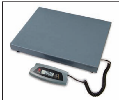
75kg and 200kg models available with large platform